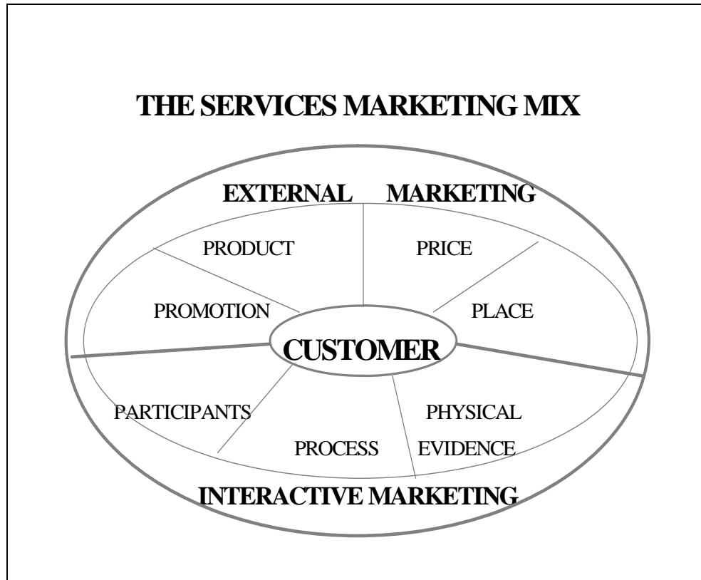
Figure 4: The Services Marketing Mix

Source: Daly, Aidan, Lets Improve in proceedings of the Quis 9 International Research Symposium on Service Excellence in Management, Sweden, June 2004.